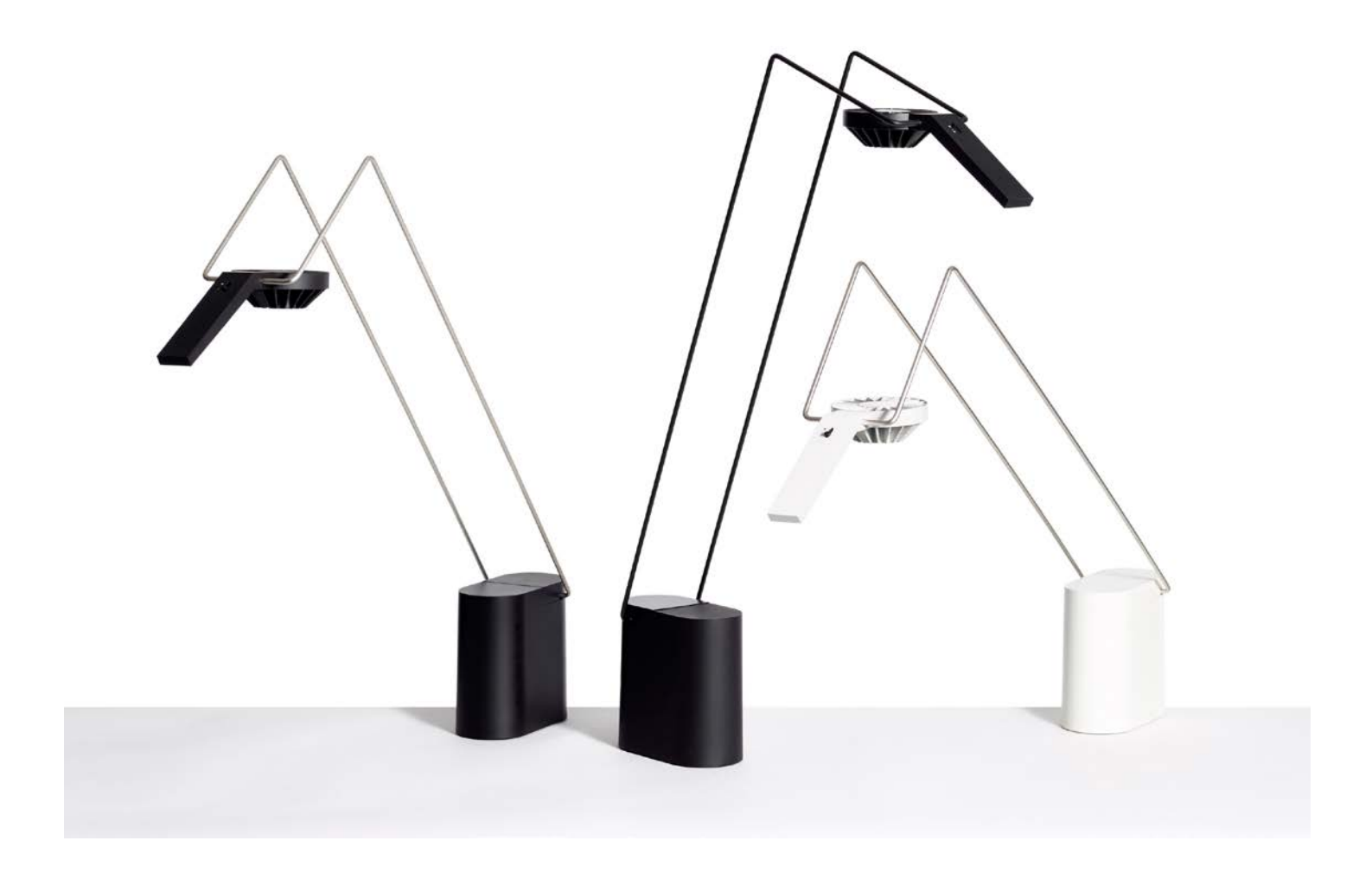
Designed by Antenna Design